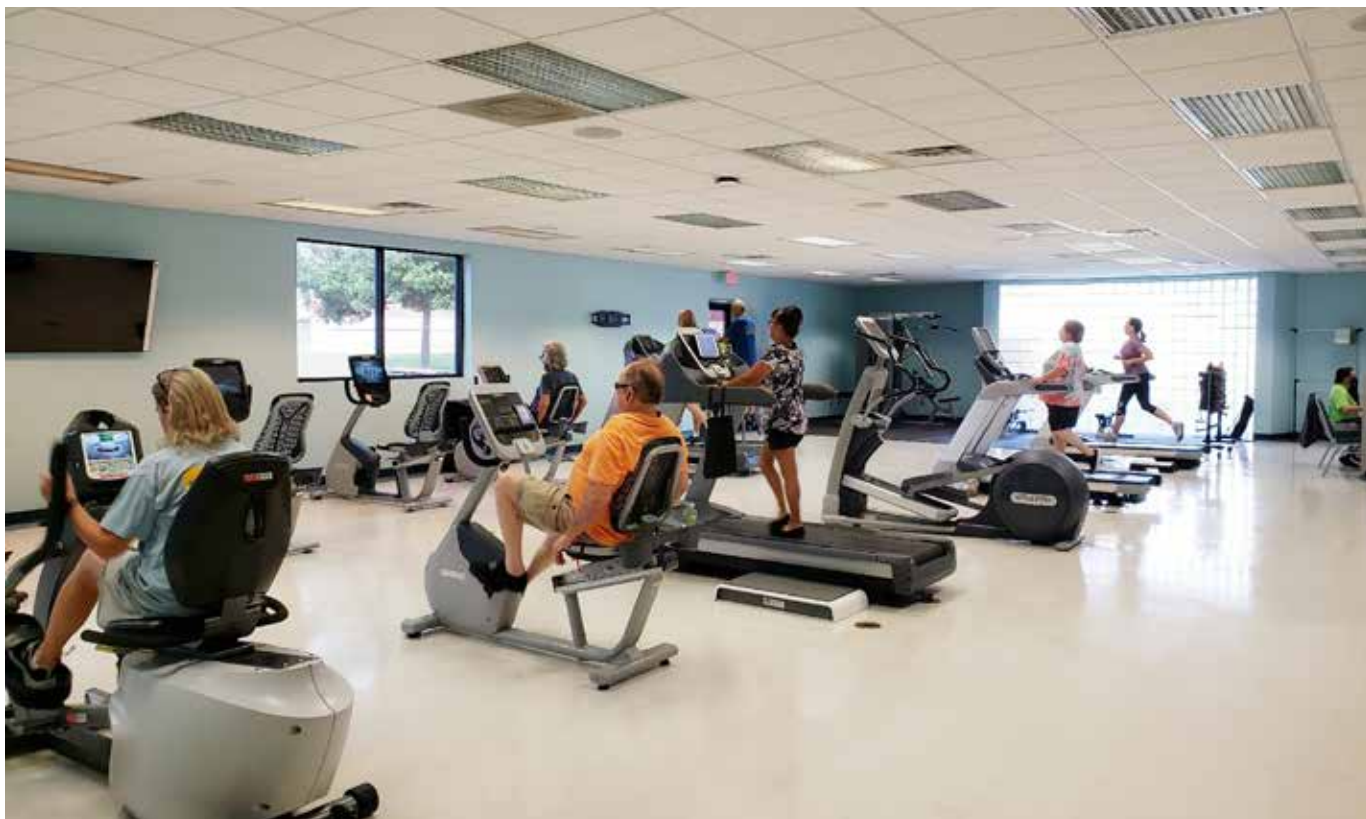
At Wylie Senior Recreation Center in Wylie, Texas, a fitness area and a variety of activities support adults ages 55+ in adopting a wellness lifestyle.