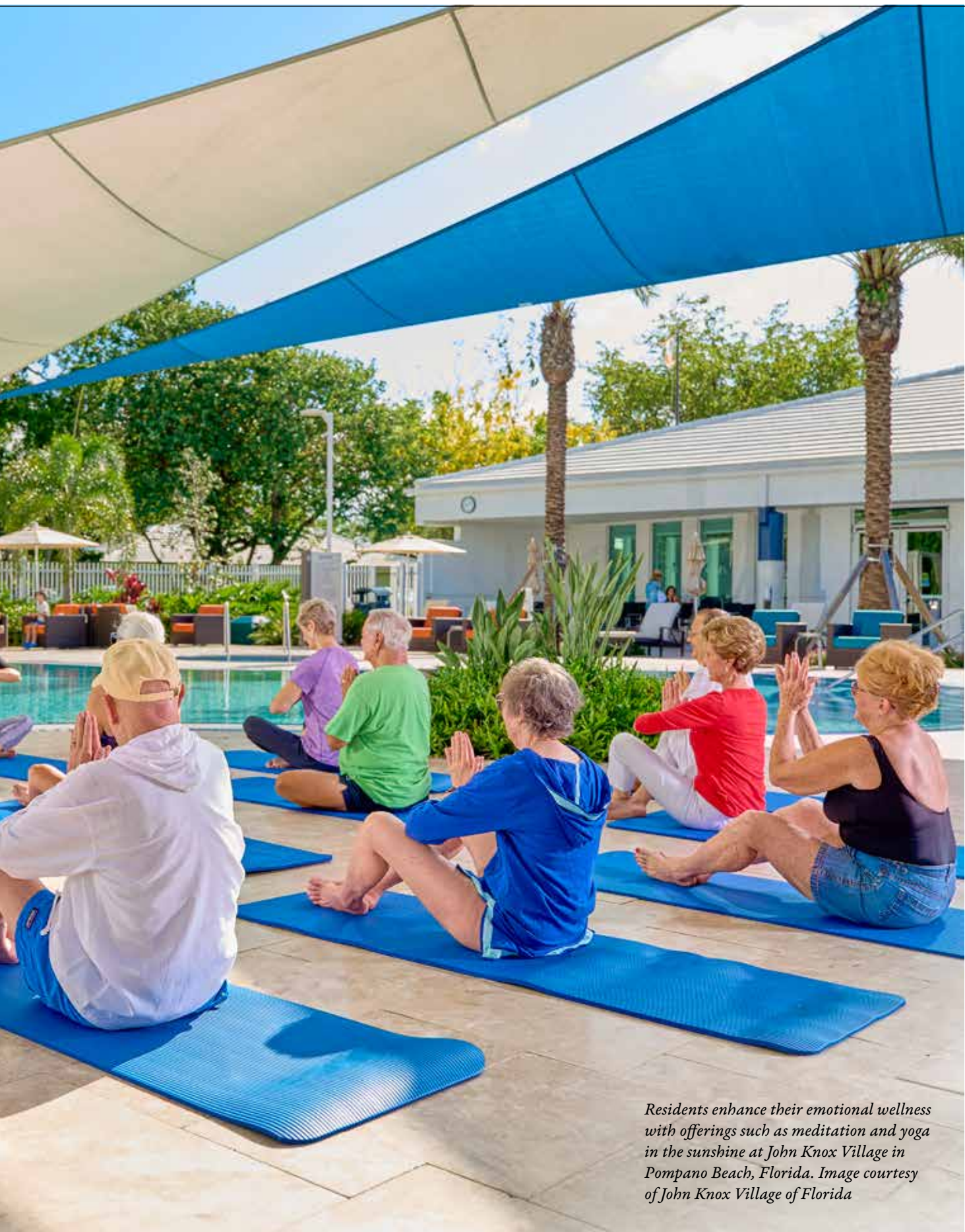
Residents enhance their emotional wellness with offerings such as meditation and yoga in the sunshine at John Knox Village in Pompano Beach, Florida.