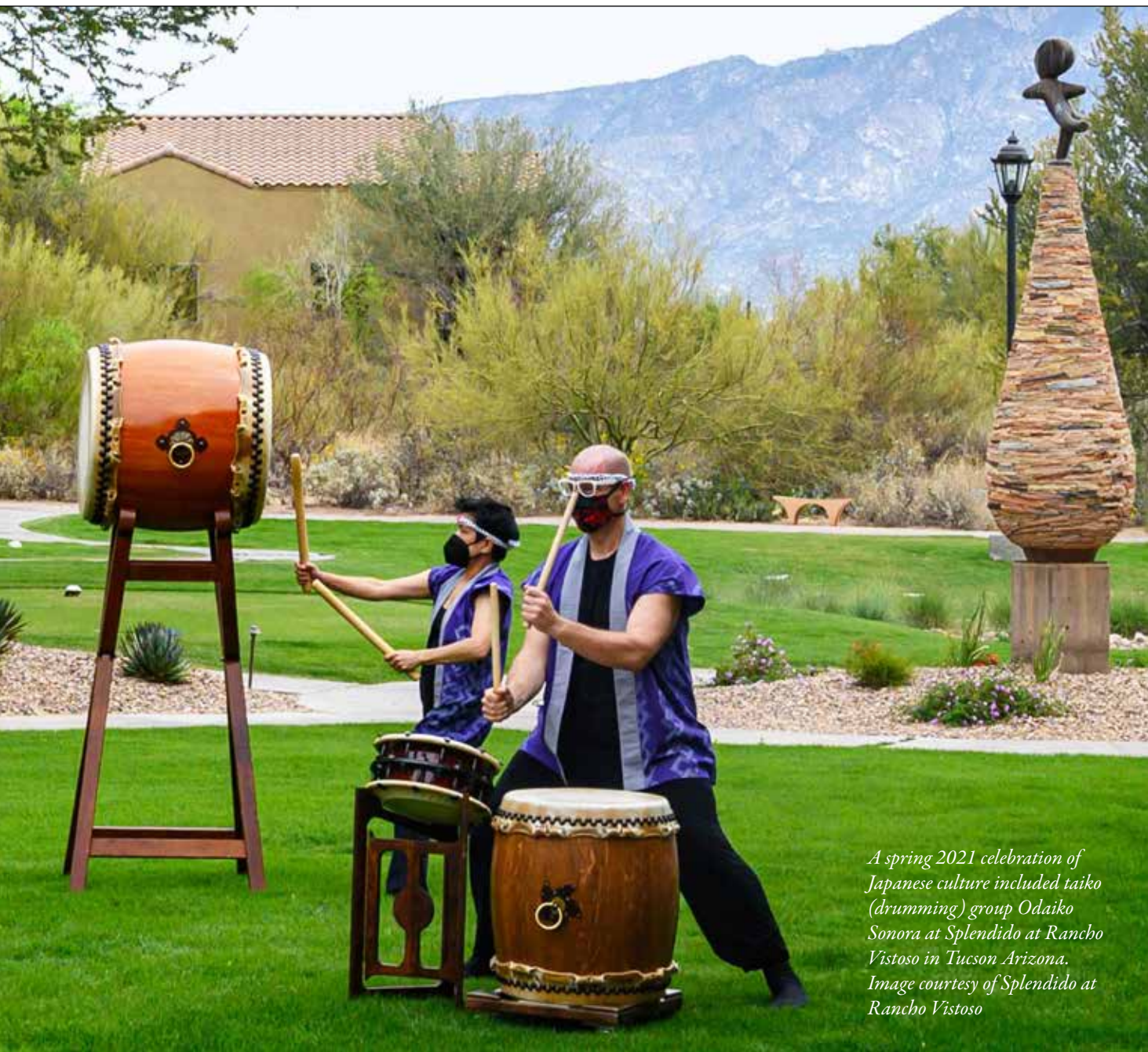
A spring 2021 celebration of Japanese culture included taiko (drumming) group Odaiko Sonora at Splendido at Rancho Vistoso in Tucson Arizona.

From 1998 to 2018, NuStep, a leading manufacturer of recumbent cross-trainers used in healthcare, senior living and fitness settings worldwide, sponsored the NuStep Pinnacle Award program to recognize senior centers and senior communities that enrich lives through comprehensive wellness programming. In 2019, ICAA and NuStep partnered to create the ICAA NuStep Beacon Award to reward the “Best in Wellness” senior living communities.