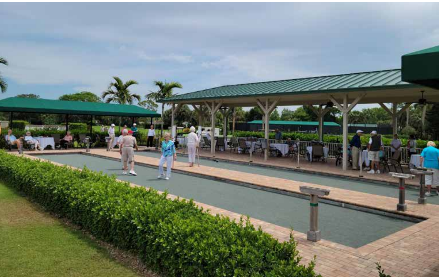
Bocce enthusiasts play a game on the Moorings Park courts in Naples, Florida. In 2021, the community repeated as a top five 'best in wellness' community with another ICAA NuStep Pinnacle Award.